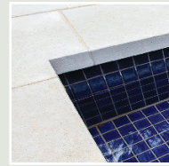
Square Edge Coping